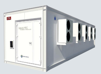
Mission Critical Power Units